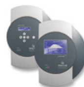
Solar-Log 500/1000™ Data logger