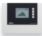
StecaGrid Vision Display unit