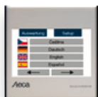
StecaGrid Monitor Data logger