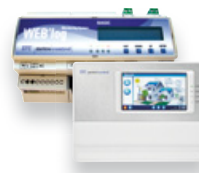
Meteocontrol WEB'log and Meteocontrol WEB'log Comfort Data logger